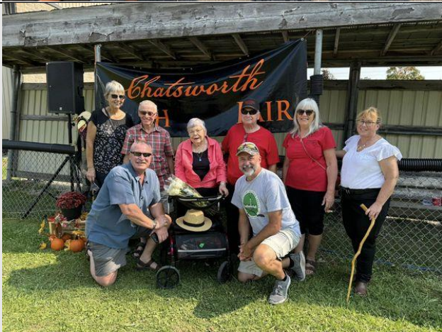
Attending the Township of Chatsworth Fall Fair (14 Sep 2024)