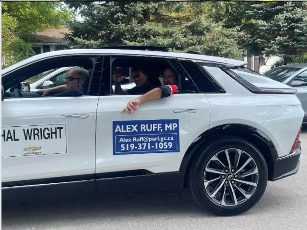
Cruising in the parade at the Arran Tara Fall fair (13 Sep 2024)