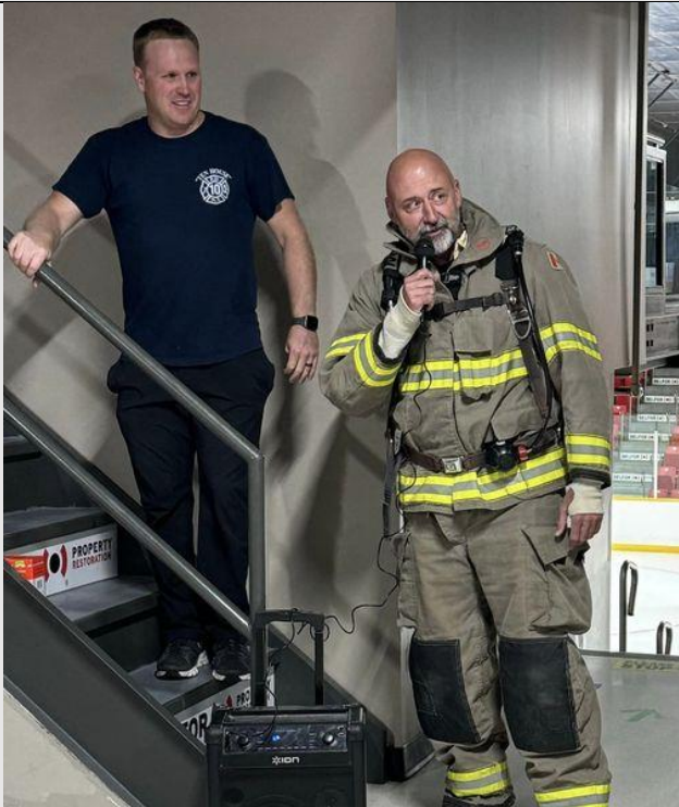
Participating in the 9/11 memorial stair climb with local first responders (08 Sep 2024)