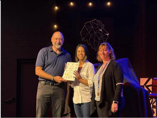
Recognizing Happy Hearts Daycare for 50 years in business (06 Sep 2024)