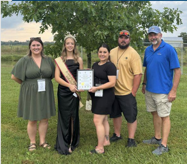
Attending the Elmwood Homecoming (30 Aug 2024)