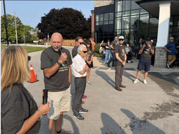
Participating in the Meaford Long Term Care's Community Walk to Wellness (14 Sep 2024)