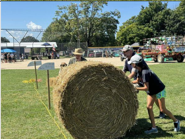
Participating in the festivities at the Desboro Fall Fair (31 Aug 2024)